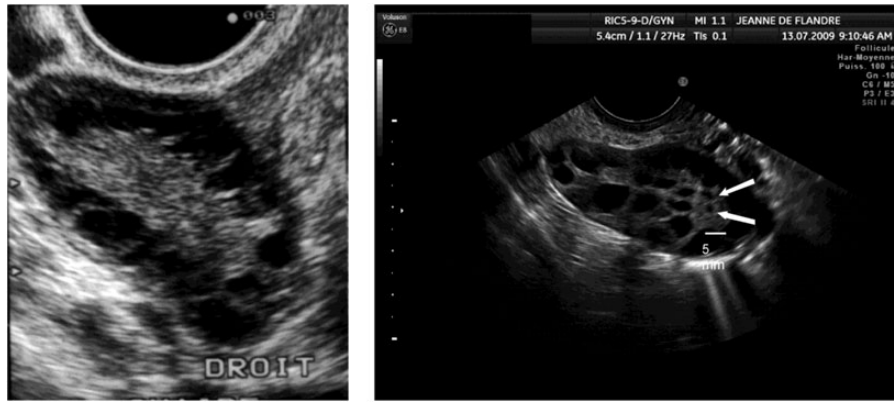
Figure 1 Picture of PCOM obtained with old (2001, left panel) and new (2009, right panel) ultrasound equipment. Small follicles \leq 2 mm in diameter (arrows) can be visualized and counted with the new equipment. Reproduced from Dewailly et al. (2011) with permission from Oxford University Press, Copyright 2011.